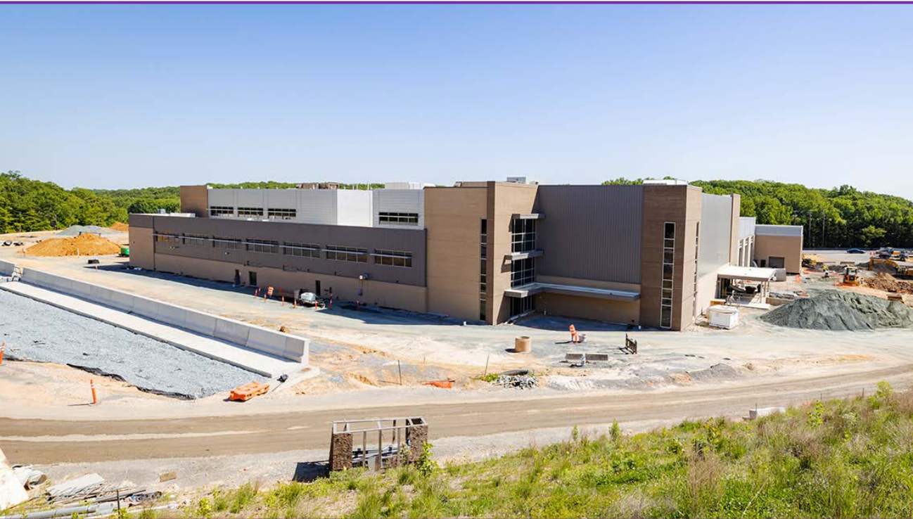
The Glenridge Operations and Maintenance Facility exterior and interior (inspection pit)