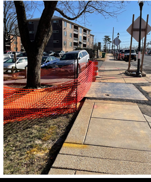
Photos clockwise from left: (Before) Crews from Priority Construction work on sidewalks in front of the University of Maryland's Stamp Student Union on March 27. (After) New sidewalks were in place in time for Maryland Day. (Before) Utility relocations were completed on sidewalks along Arliss Street and Piney Branch Road in Silver Spring in February. (After) Crews from Kaslo Enterprises put the finishing touches on new sidewalks along Piney Branch Road.