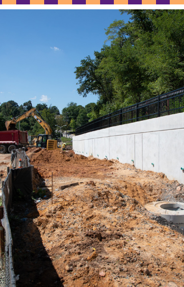
From left to right: Crews continue to advance construction of the light rail vehicle bridge over Rock Creek in Montgomery County. They are building the formwork for the bridge deck that will soon be filled with concrete. In New Carrollton, stormwater pipe installation continues in Prince George's County.