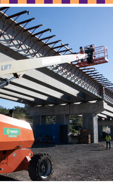
From left to right: Crews complete the first of three concrete pours in the Montgomery County section of Rock Creek Park for the light rail bridge deck. Once completed, the elevated bridge carrying the Purple Line light rail vehicles and the pedestrian bridge will have an unobstructed view of the creek. Work continues on the Riverdale Park-Kenilworth elevated station, installing safety measures and wooden forms to make way for reinforced steel and pouring concrete. The station will connect to a flyover that crosses Kenilworth Avenue headed north.