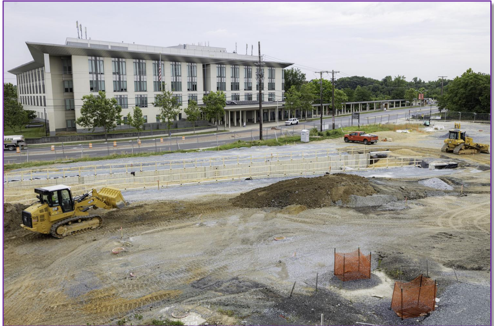
College Park Metro bus loop construction zone