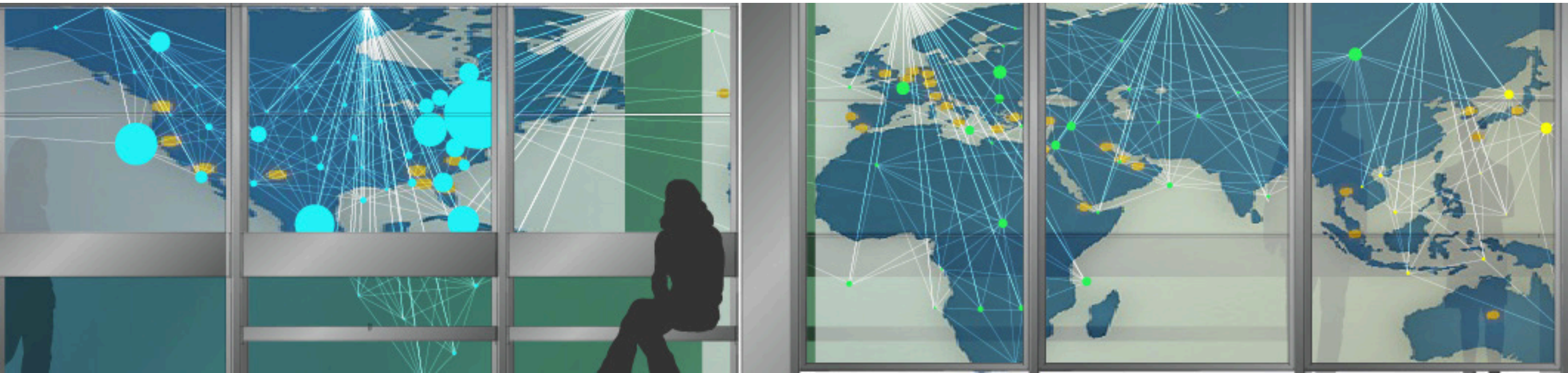
DATA: STUDENT HEADCOUNT PER LOCATION

* Approximated visualization composed for conceptual purposes, accurate data will be developed for final design