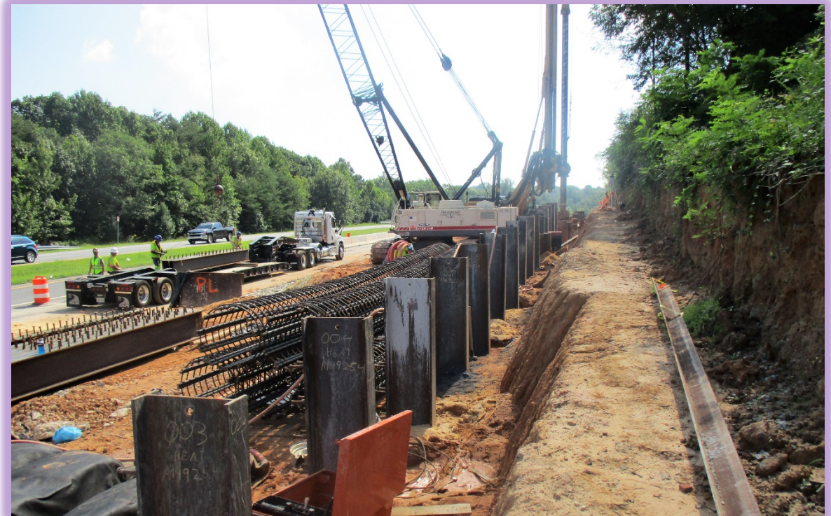
Wall installation along Veterans Pkwy.